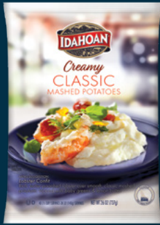
CREAMY Classic Mashed Potatoes

Idahoan potatoes offer delicious, scratch-like quality and flavor with added convenience and operational benefits. With offerings for classic and flavored mashed potatoes, hash browns, grab-and-go solutions, clean label alternatives, and more, Idahoan potatoes ensure that you can serve perfect potatoes with pride while saving time and money over fresh, frozen, and refrigerated alternatives.