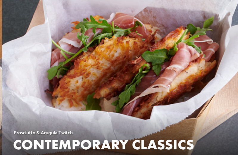
Prosciutto & Arugula Twitch