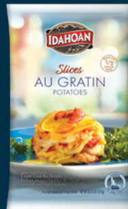
SLICES Flavored and Unseasoned