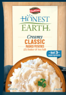
HONEST EARTH® Simple Ingredients, Clean Label Potatoes