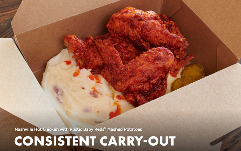
Nashville Hot Chicken with Rustic Baby Reds® Mashed Potatoes