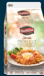
SHREDS Hash Browns and Mixes