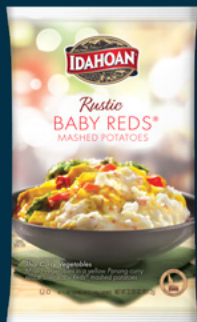
RUSTIC Mashed Potatoes