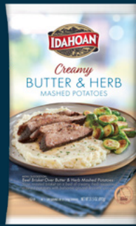
CREAMY Flavored Mashed Potatoes