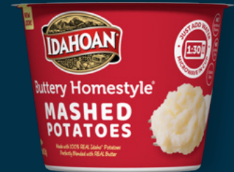
CREAMY Flavored Mashed Potatoes Single-Serve Cups