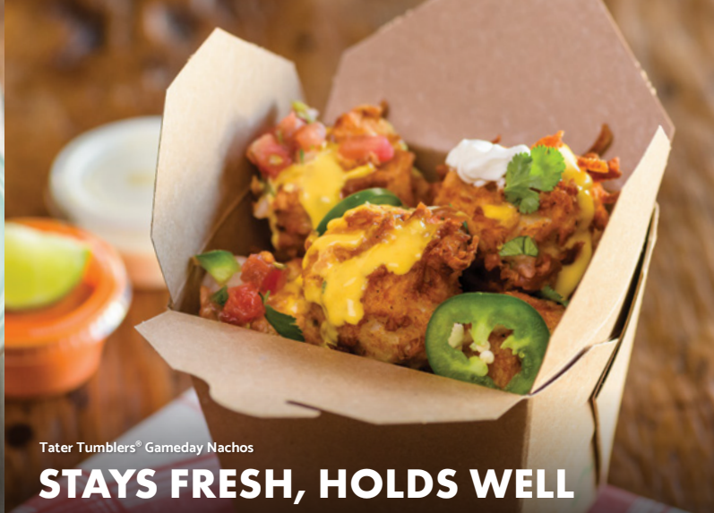
Tater Tumblers® Gameday Nachos