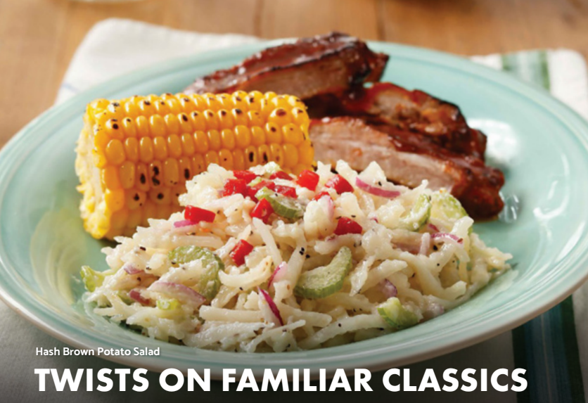
Hash Brown Potato Salad