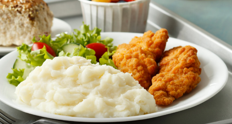
Chicken Tenders with SmartMash® Potatoes & Salad