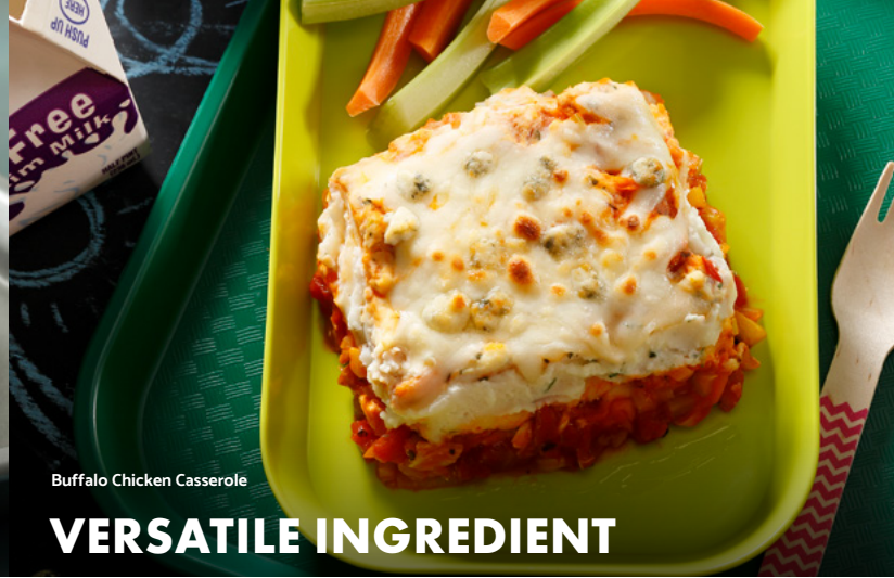
Buffalo Chicken Casserole