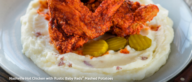
Nashville Hot Chicken with Rustic Baby Reds® Mashed Potatoes