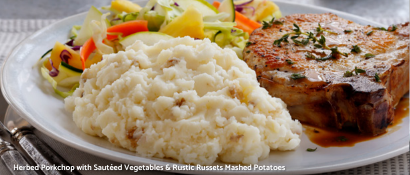
Herbed Porkchop with Sautéed Vegetables & Rustic Russets Mashed Potatoes