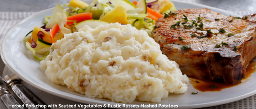
Herbed Porkchop with Sautéed Vegetables & Rustic Russets Mashed Potatoes