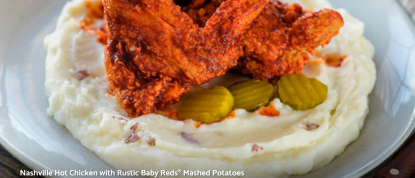
Nashville Hot Chicken with Rustic Baby Reds® Mashed Potatoes