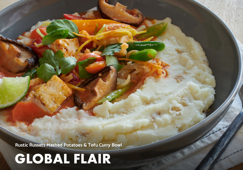
Rustic Russets Mashed Potatoes & Tofu Curry Bowl