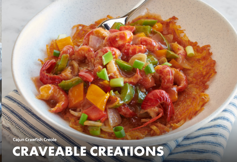
Cajun Crawfish Creole