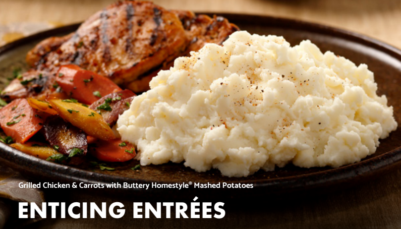
Grilled Chicken & Carrots with Buttery Homestyle® Mashed Potatoes