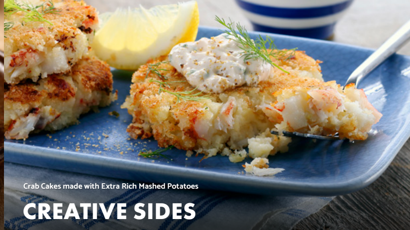
Crab Cakes made with Extra Rich Mashed Potatoes