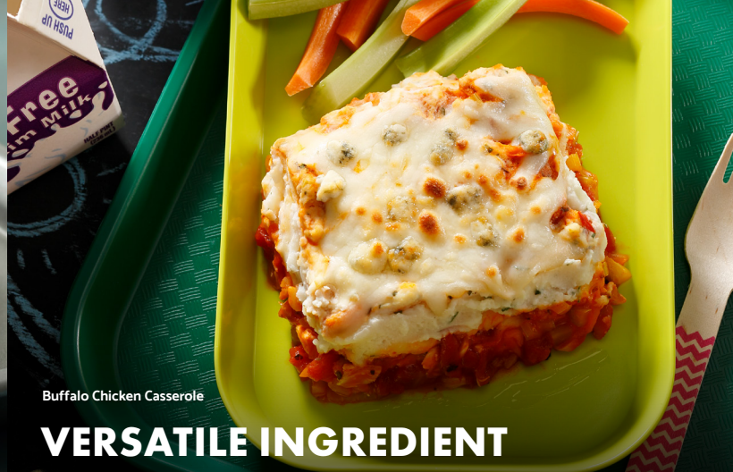
Buffalo Chicken Casserole