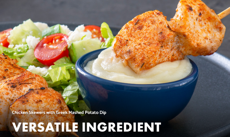
Chicken Skewers with Greek Mashed Potato Dip