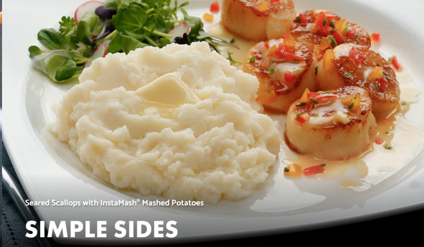
Seared Scallops with InstaMash Mashed Potatoes